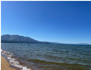
Beautiful Lake Tahoe