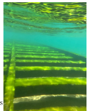
The Sunken Tracks