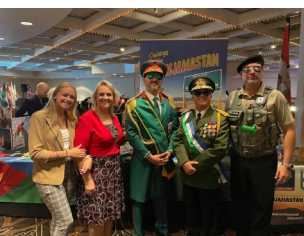
Molossians Meeting Slowjamastanis.