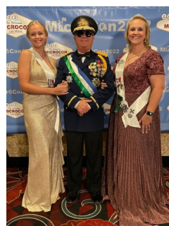
The President, First Lady and Chief Constable.