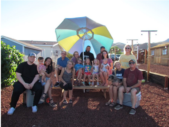
The Molossian Family, gathered from far-flung locales!