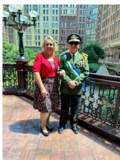
The President and First Lady.