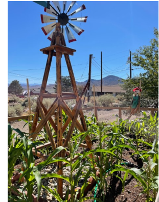
Bounty from Molossia's Victory Garden and Farm, and the burgeoning Molossia cornfield!