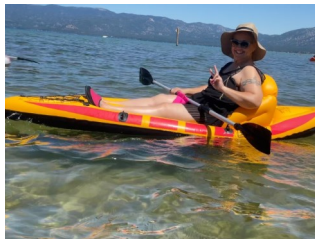
The First Lady Afloat

On Monday, 15 August 2022 XLV the Molossian Navy deployed to nearby Lake Tahoe, a favored spot for the Navy's many voyages of discovery. The focus of this mission was to explore some mysterious sunken railroad tracks, just offshore from Pope Beach, a favored sun and sand location at the south end of the lake. Arriving at about 1:30 PM MST, the Navy deployed immediately onto the lake, and quickly set out to find and explore the sunken tracks. After an arduous trek across the waters, the fleet arrived at their destination. The underwater tracks lie just offshore from the area of Valhalla, a series of palatial vacation homes of Lucky Baldwin, the 19th century California millionaire businessman, and his contemporaries. They were used during the late 19th and early 20th century to move large yachts to and from the water from boathouses on the shore. In the century since the heyday of the millionaires, the lavish boats are gone and the old boathouses have been repurposed, in the case of one, into a theater. The former boat tracks now lie abandoned and rusting away slowly in the clear waters of Lake Tahoe. The Molossian fleet explored the tracks and their environs for a while, marveling at this long-forgotten piece of history, before eventually voyaging back to their starting point. The fleet then returned to Molossia, by way of a favorite burger stand, another successful mission for the Mighty Molossian Navy!