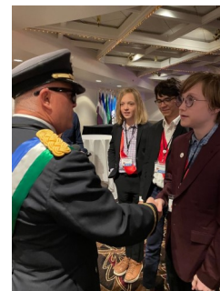
The President Meeting with Young Micronationalists.

On 5 and 6 August 2022 XLV the Republic of Molossia was honored to participate in the fourth major intermicronational get-together and conference, MicroCon 2022. Hosted this year by the Grand Duchy of Westarctica, MicroCon is a meet-up of micronationalists from around the world. The entire event was held at the Sam's Town Hotel and Casino, in Las Vegas, Nevada. The evening before the event began many micronationalists gathered for a diplomatic reception at the hotel. This allowed the leaders of the assembled nations to gather socially, exchange ideas and generally get to know each other. Most micronationalists come from locales far from each other and the opportunity to meet and greet was a welcome one.