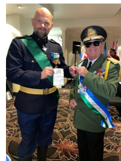
The President and Grand Duke Travis of Westarctica.