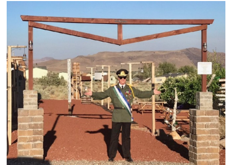
The Friendship Gateway

As I speak, over the border from Molossia flies another symbol. It is not the American Flag, under which so many have fought and died to protect freedom, but a version of the Confederate flag, a symbol of hate and racism. This flag, so popular among those that fear and despise diversity, flies in direct contrast to our Gateway, which stands for freedom and celebrates diversity. That flag has flown now for over a month and I watch it every day. As each day passes I note that it is becoming more faded in the sun and tattered in the wind. Someday soon, that flag will be gone and so too I believe that can be the course of hatred and xenophobia. Like the flag we can hope that walls between peoples will also one day fall. There are no walls attached to our Gateway, there is only the Gateway itself standing now and forever as Molossia's symbol to the world of peace, openness, goodwill and friendship. We all share a part of this amazing world, and let us therefore walk through this Gateway together toward a brighter future for all.