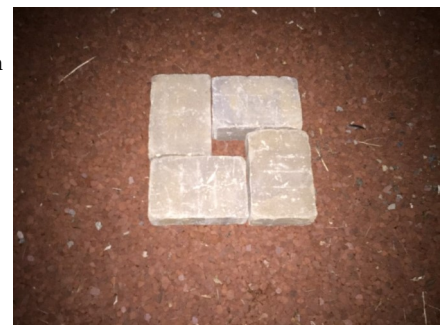
The First Bricks