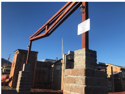
The Gateway Complete