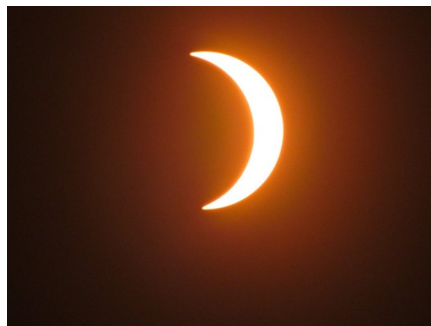
At the Height of the Eclipse