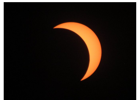
The Sun Returns