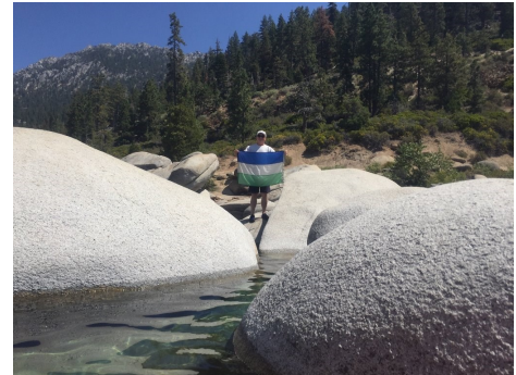
Molossia's Flag Among The Rocks