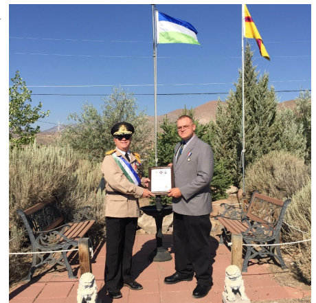
Receiving The Knighthood