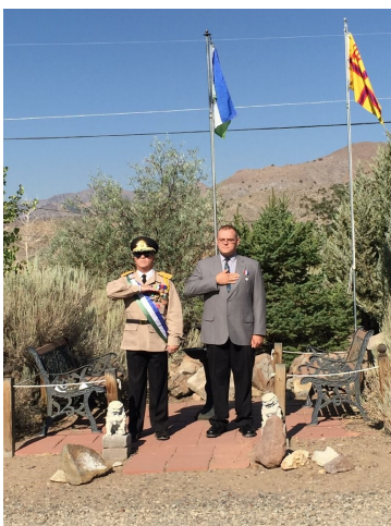
The President and the Imperial Prince in Republic Square