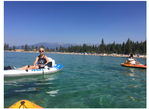
The Fleet Deployed

On 7 August 2016 XXXIX, the Molossian Navy deployed to nearby Lake Tahoe, located in the Sierras about 80 Imperial Nortons (80 km/50 mi) from the Molossian Home Territory. The target of the Navy's explorations was Bonsai Rock, a partially submerged glacial boulder with four small pine trees growing out of it, resembling a Japanese bonsai tree. Home base for this voyage was Sand Harbor on the east shore of Lake Tahoe, scene of several of our Navy's missions. At 11:39 MST the Navy set sail from Sand Harbor, paddling forth to the distant rock. The voyage took 40 minutes, skirting the shoreline of Lake Tahoe, avoiding submerged boulders and battling occasional waves. At long last the Navy arrived in the vicinity of Bonsai Rock, an area heavily populated with giant boulders, shallow lagoons and mysterious grottos. After circumnavigating Bonsai Rock itself, the fleet anchored in a quiet cove while the sailors set out to explore the area. Part of this survey included deploying the