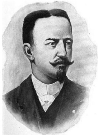
Prince James I of Trinidad

He designed postage stamps, a national flag, and a coat of arms; he established a chivalric order, the "Cross of Trinidad;" he bought a schooner to transport colonists; he appointed M. le Comte de la Boissiere as Secretary of State and opened a consular office at 217 West 36th Street in New York, and even issued government bonds to finance construction of infrastructure in the island.