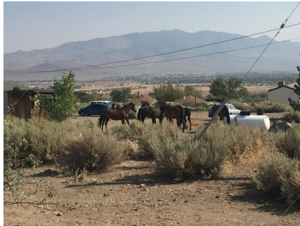
Wild horses invade our nation!