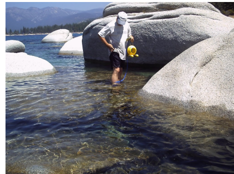
Launching The Seahorse 2