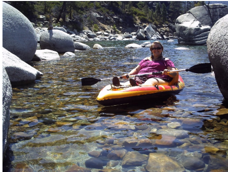
Navigating Close Quarters