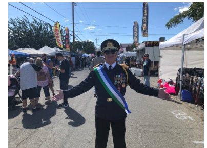
Dayton Valley Days!