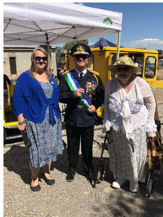
Receiving A Medal