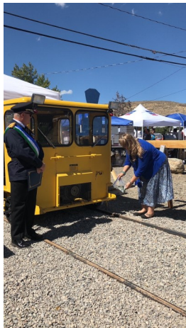
Christening The Railroad