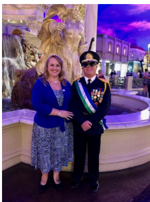
The First Couple, Meetup Ready