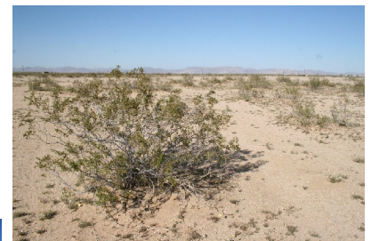
Desert Homestead Province