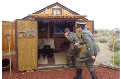
East Germans Sneaking Around