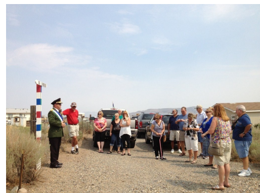
The President Giving A Tour