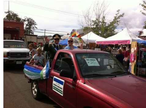
On The Parade Route

The parade began at 10:39 AM MST, near the courthouse in Dayton, and followed Pike Street and then Main Street in that town. All along Main Street were vendor booths, set up for the celebration. In addition, there was a decent crowd of spectators, there to enjoy the parade. The crowd was very pleasant and friendly, smiling and waving to The President and First Lady. It was an amazing, enjoyable experience.