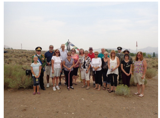
The Whole Group