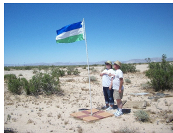
Saluting the flag over the Province