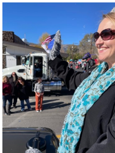
The First Lady Waving.