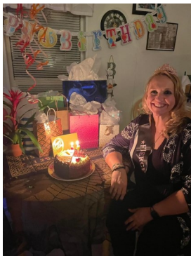
The First Lady's Birthday - a True Day of Merriment!