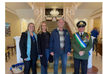
Meeting with Nevada Governor Lombardo and His First Lady.