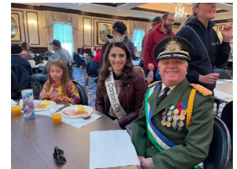
Breakfast with Nevada Royalty!