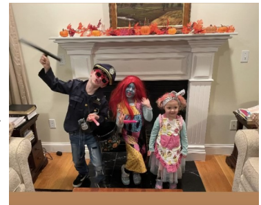
Molossians all Over, Dressed for Halloween!