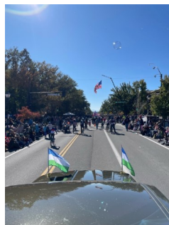
Crowded Parade Route Ahead!