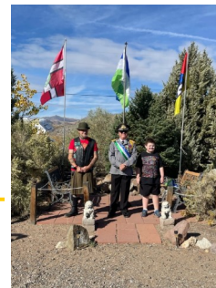
Ceremony in Republic Square