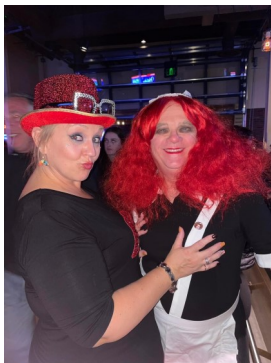
The President - that's right, The President - and the First Lady at the Rocky Horror Picture Show!