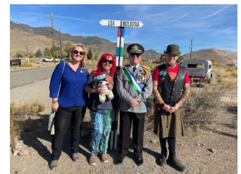
The Guv'na and Guv'ness of DonSam Wadi with The President at the Border