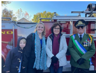
With Nevada Senator Jacky Rosen.