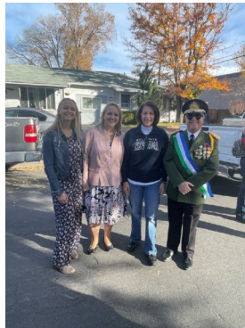
With Senator Catherine Cortez Masto.