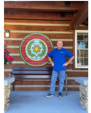
The President Visiting EBCI Headquarters.