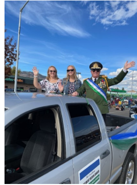
On the Parade Route.