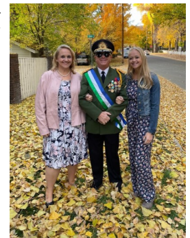
The President, First Lady and Chief Constable.

On 30 October 2021 XLIV, His Excellency, The President, The First Lady and the First Family participated in the annual Nevada Day Parade event. Located in Carson City, Nevada, this was the 83rd occasion of the parade, which takes place on or around Nevada Day, the annual celebration of the admission of Nevada as a state. Nevada was admitted to the Union on 31 October 1864. At that time, the state was a significant producer of silver and gold, and therefore played a major role in financing the Union war effort during the United States Civil War. Nevada's admission as a state helped not only to pay for the War, but ensured a northern majority in Congress afterward.