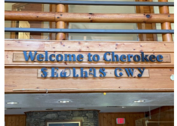
Welcome to Cherokee

During their visit to Cherokee, the heart of the Eastern Band's territory, His Excellency had sought to meet with the Principal Chief to discuss sovereignty. Regrettably a meeting could not be arranged; instead, the First Family toured the Nation, experiencing the history, culture and government of the tribe. The Eastern Band has a thriving economy largely from tourism and revenue is directed at economic development, as well as tribal welfare and support of cultural initiatives, such as the language immersion program and development of historic preservation programs. The Cherokee language, using the syllabary developed by Sequoia, is used throughout the Nation. It was an excellent experience for the First Family to visit this Cherokee homeland, a nation within a nation, surviving against the odds to thrive and to preserve Cherokee life, culture and traditions.