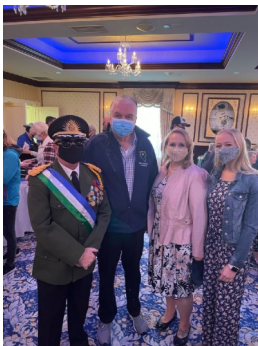
With Governor Sisolak.