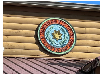
Cherokee Nation Seal