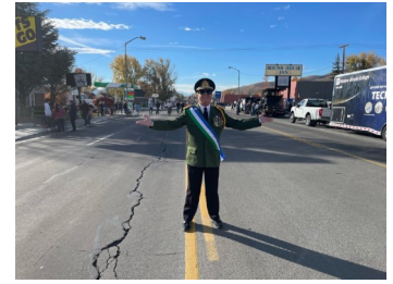
It's a Great Day!