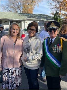
With Senator Jacky Rosen.