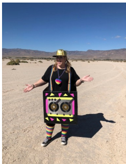
The First Lady's DJ Box