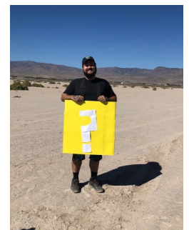
Tony's Mystery Box