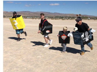
The Guy's Race