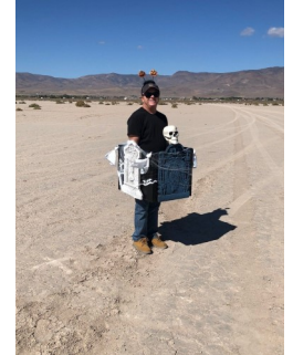
The President's Halloween Box