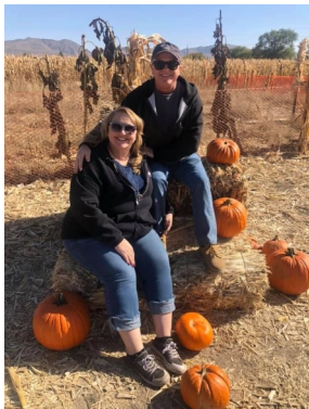
In the Pumpkin Patch! Molossians celebrating Autumn!