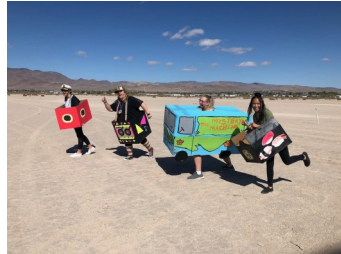
The Girl's Race