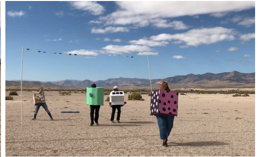
Ladies Backwards Race