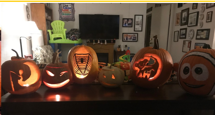
Happy Halloween! Jack O'Lanterns in Government House and a Tarantula in Red Square!