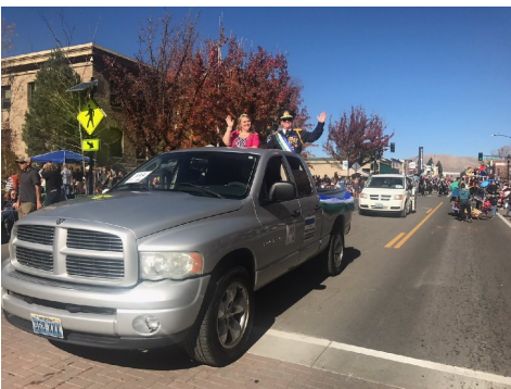
Waving To The Crowd

The parade route stretches for about 1.2 Imperial Nortons (1.2 km) through the middle of Carson City, the state capital of Nevada. Along the route several reviewing stands are set up, with announcers introducing each parade entry. As years go by the announcers get better and at pronouncing the name of our nation correctly. As the President passed the spectators, many called out, wanting to know where Molossia is located. His Excellency and the First Lady responded and the good humored crowd generally took it in stride that there was a sovereign nation right down the road from them, inside their own state. At one point a coterie of sign-waving fans of Molossia excitedly greeted The President and First Family, stopping the parade for a photo op - a wonderful experience for all! Eventually the parade ended, The First Family adjourned to the annual chili feed and then returned to Molossia. A fine time was had by all and as always we all look forward to next year's Nevada Day Parade.