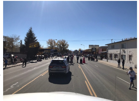
On The Parade Route