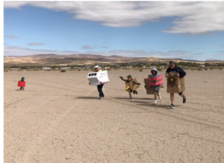
The Guys' Race