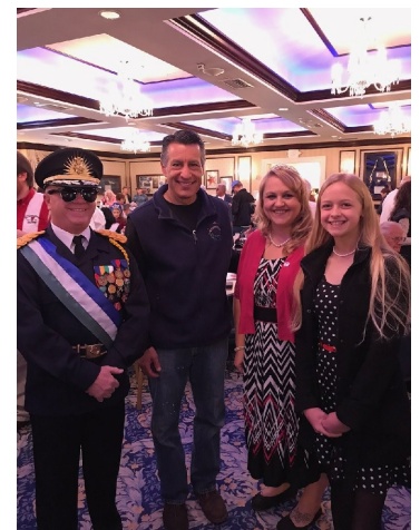
Governor Photo Op