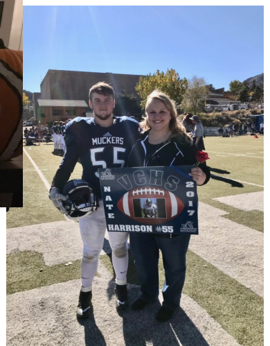
Senior Day at Virginia City High School