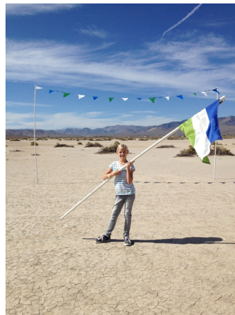
Waving the Flag