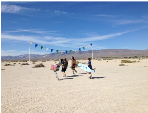
The Kids Race

On 6 October 2013 XXXVI, the Republic of Molossia hosted the 2013 Misfit Regatta. Inspired by the famous Henley-on-Todd Regatta held in Alice Springs, Australia, the Misfit Regatta is a dry land cardboard boat race. It takes place on Misfit Flats, some 16 Imperial Nortons (16 km / 10 mi) east of Molossia. Famed for being a filming location for the Clark Gable/Marilyn Monroe movie "The Misfits", the Flats are an open, dry lakebed, perfect for racing. At 11:50 AM Molossian Standard Time (MST) the racers arrived at the Flats and helped set up the start and finish lines. Then at about 12:00 PM MST the first race took place, with cameras rolling and spectators cheering. There were several races held, including kids only, adults only, group, guys only, ladies only, and backward for kids and for adults. A total of eight racers competed. Molossian citizen Bryce Cardoza was to be the racer to beat, winning every race in which he competed. Close seconds were His Excellency, The President and Molossian citizens Alexis Baugh and Nathan Harrison. The racers competed with all their might and had much to be proud of. After seven races, the event was ended and declared a resounding success. Today's Regatta was just the second of many, with one planned every other year at this time. Future races may include an obstacle course and a competition for best "boat", which will include non-racers and fans of Molossia from around the world. Well done racers, and see you in two years!