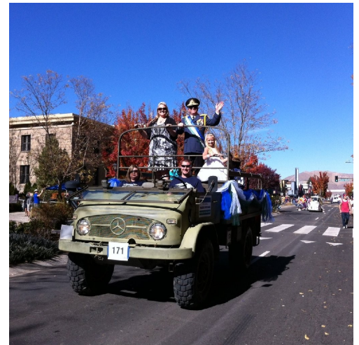
On The Parade Route