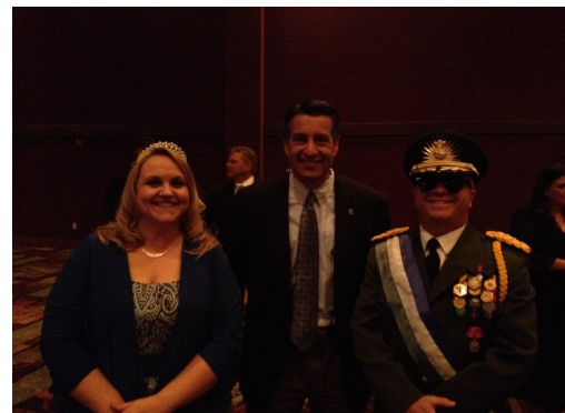
The President and First Lady with Nevada Governor Brian Sandoval