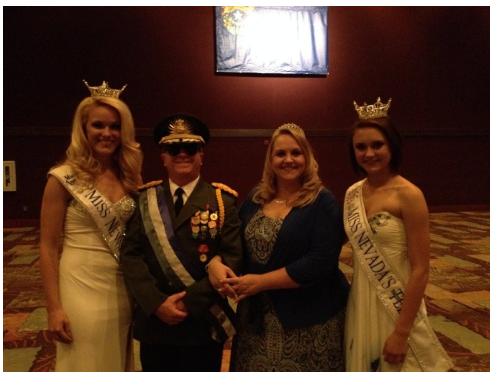
The President and First Lady with Miss Nevada and Miss Teen Nevada