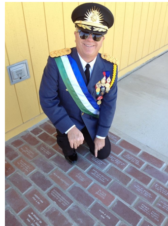
Molossia's Brick at the Nevada State Railroad Museum!