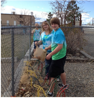
Tidying Mark Twain Park