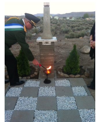
Lighting the Lamp of Honor