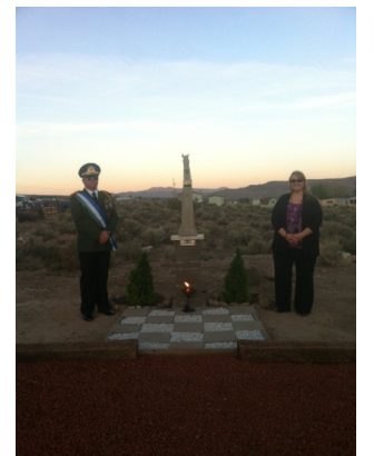
The Heroes Monument