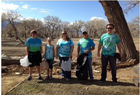
Ready to Clean RollingAsia

On 5 April 2014 XXXVII the Republic of Molossia observed Qingming, our spring holiday. Qingming is adopted from the Chinese festival of the same name which takes place around early April each year. The Chinese holiday is one for enjoying the greenery of springtime and tending to the graves of departed ones. Here in Molossia the holiday is geared more toward general cleanup, often in neighboring areas outside our nation. This year the holiday began with a trip out to the newly liberated enclave of RollingAsia, not far from Molossia. For a good while the citizens of Molossia tramped around RollingAsia, on a quest to pick up trash. It turns out that the users of the park are a remarkably responsible lot, and very little garbage was to be seen. Undaunted and determined to clean up someplace, the intrepid Molossians departed RollingAsia and moved to Mark Twain Park, fairly close to Molossia. While not terribly messy by any means, there was a bit more garbage to pick up at Mark Twain Park, and a half hour there tidied up the park nicely. Once the park was cleaned, the First Family traveled to the town of Dayton and there enjoyed Subway sandwiches, cold food being another Qingming tradition. Lunch done, the Molossians returned to their own nation and spent the afternoon and evening painting, cleaning and organizing. As dusk fell, thus ended our nation's Qingming observance and a fine time was had by all.