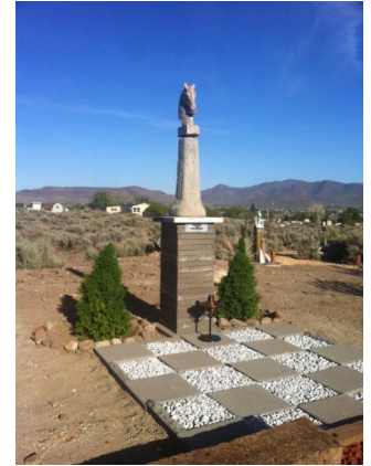
The Heroes Monument