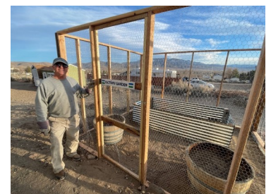
The President at the Garden.