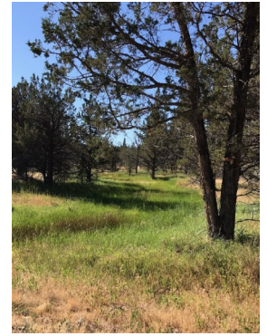
Deer Run Creek.

After seven years as a Colony of Molossia, Farfalla, our distant territory in Northern California, has been elevated to the status of Province. Farfalla Province is located in central Modoc County, about 11 Imperial Nortons (11 km / 6.5 miles) north of the town of Alturas, California. Farfalla is about 7,965 Square Royal Nortons (2 hectares / 4.9 acres) in size and is covered in pines. A small seasonal creek runs through the center, and a year-round spring feeds into the creek. The colony is about .5 Imperial Nortons (.5 km) north of a small lake, and lies in a hilly area known as Mahogany Ridge. The landscape is replete with juniper and piñon trees, wild flowers and grasses. Butterflies abound, hence the name of the colony, for the Italian word for butterfly. This is beautiful country and the pride of Molossia.