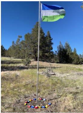
Molossian Flag Over Farfalla.

After seven years as a Colony of Molossia, Farfalla, our distant territory in Northern California, has been elevated to the status of Province. Farfalla Province is located in central Modoc County, about 11 Imperial Nortons (11 km / 6.5 miles) north of the town of Alturas, California. Farfalla is about 7,965 Square Royal Nortons (2 hectares / 4.9 acres) in size and is covered in pines. A small seasonal creek runs through the center, and a year-round spring feeds into the creek. The colony is about .5 Imperial Nortons (.5 km) north of a small lake, and lies in a hilly area known as Mahogany Ridge. The landscape is replete with juniper and piñon trees, wild flowers and grasses. Butterflies abound, hence the name of the colony, for the Italian word for butterfly. This is beautiful country and the pride of Molossia.