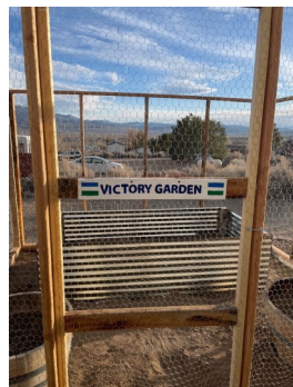
Victory Garden Sign.