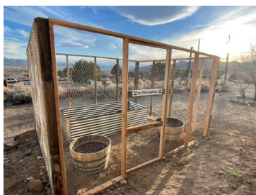
The Victory Garden.

The Republic of Molossia continues its foray into the new agricultural age with the advent of our Victory Garden. As mentioned last month, with the announcement of Molossia's chicken coop, to attain more self-sufficiency our government is launching a concerted effort to produce our own food. The latest venture is the creation of a large garden, enclosed to keep out rodents, with a wide variety of vegetables grown for our nation's consumption. This garden will be titled our Victory Garden, a nod to our nation's efforts in the ongoing war against East Germany. Victory Gardens were a staple in many nations during the First and Second World Wars, to reduce pressure on the public food supply and thus contribute to the war effort. Molossia's Victory Garden is envisioned to do the same. While our nation, lacking as it does area and natural resources, will likely never be food self-sufficient, steps such as the chicken coop and Victory Garden are extension of our ongoing Functionality and Sustainability Project, ensuring that our infrastructure works and sustains our nation. This continuing farming initiative will certainly reduce our dependency on US markets for food as well as enhancing our independence and national pride, and makes our great nation even greater!