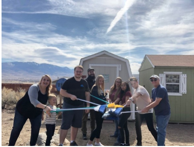
Ready To Play

It's time again for Molossian Broomball, the famous game with no rules! Though honestly we Molossians aren't a real athletic bunch, when the mood strikes us we take up brooms and head out to play broomball. Molossian Broomball isn't like that played up in the Frozen North, none of that sissy messing about on ice stuff for us Molossians! Here, we have brooms, we have a ball and we have a rock strewn dirt patch called the Alphonse Simms Memorial Cosmodrome and Broomball Field. On this dusty sward we valiantly whack that poor ball (or balls) back and forth and spend large amounts of time retrieving them from the surrounding sagebrush. Eventually we tire of this and call it a game. Rules? None actually. If you want to have two teams, three teams, no teams, switch teams (if there are any) mid-game, have goals, have no goals, have sword fights with the brooms - anything goes. But above all the main goal is to have fun!