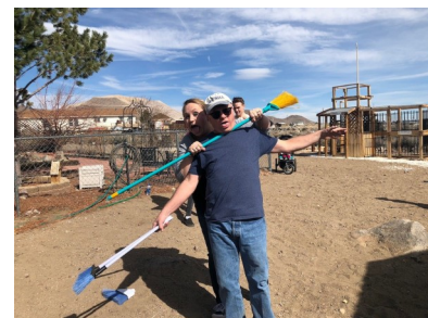
Whatever It Takes!