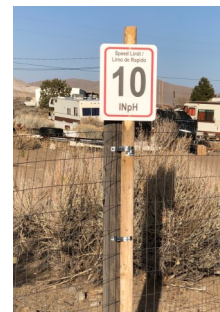
New Speed Limit Sign!