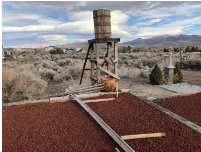
Water Wheel Down