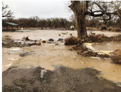
Sixmile Creek Flooding, Third Storm