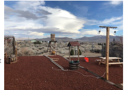
Red Square Damage

A severe windstorm battered Molossia and surrounding areas on Monday, 25 February 2019 XLII, knocking down various structures in our nation and bringing a wide variety of other damage. Wind gusts of 96 to 128 Imperial Nortons (96-128 kph/60-80 mph) slammed Molossia, ripping shingles from the roof of Government House, toppling the waterwheel in Red Square and damaging other structures. During the windstorm emergency repairs were made to Government House in the face of an oncoming rainstorm. Other repairs will be made in coming weeks. Such is life here in our nation in the High Desert, with wind being near constant - but usually not this much. But Molossia will rebuild!