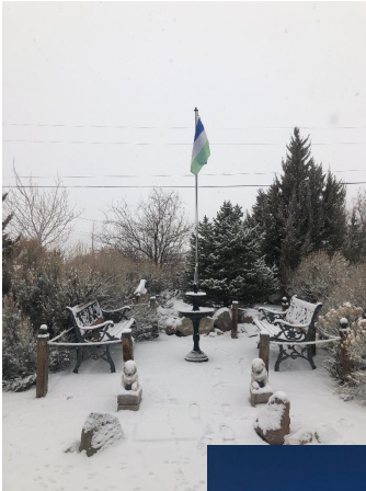
Republic Square, First Storm

snow arrived on Friday, 15 February, followed by a stronger snowstorm on the following Sunday. Of course, being a desert nation, we welcome the water that snow brings, although a little break in the foul weather would be nice. But there's not much we can do about the weather, in spite of Mark Twain's advice, so we just need to dig out, stay warm and know that sunny days are right around the corner here in Molossia!