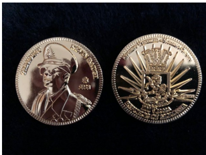
Presidential Edition in Gold

The new coins are zinc alloy, with a reeded edge and raised relief designs on the obverse and reverse. They are is 1.5 Micro-Nortons (40 mm / 1.5 in) in diameter. They are produced in limited quantities by the mint, MP Coins, in Venezuela and Spain. They can be purchased through the Bank of Molossia webpage while supplies last, and through the website of the mint, MP Coins.