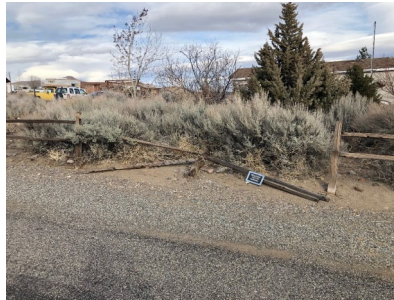
Water Wheel Down