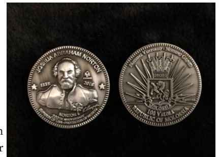
Emperor Norton Edition in Antique Silver

We are quite proud of this latest coinage, as they are yet another symbol of our nation's progress and prosperity.