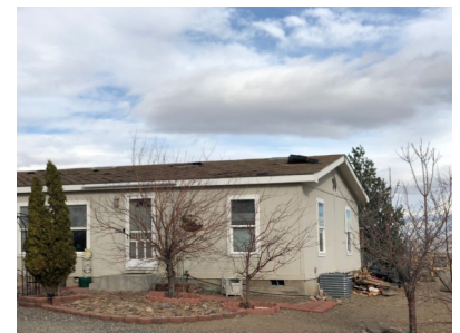
Roof Damage, Government House