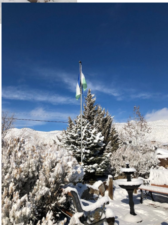
Republic Square, Second Storm