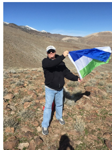
Molossia's Flag Atop Red Hill