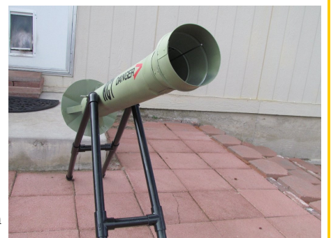
Ready for Action