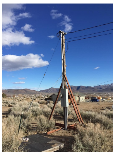
Disaster averted! Wind nearly topples Molossia's electric pole; mended quickly and ably by the Ministry of Hasty Repairs.