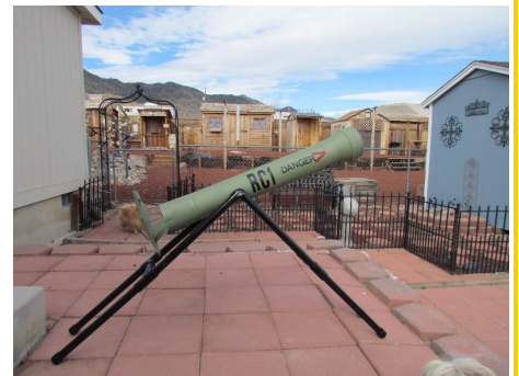
RC1 Rocket Cannon

it can ably take its place in the defenses of Molossia. We are certain that the RC1 Rocket Cannon will serve Molossia well for many years to come.