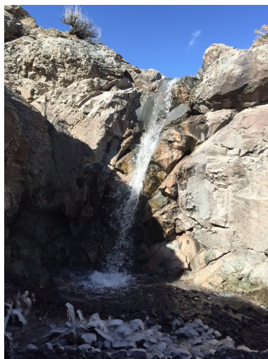
The Second Waterfall