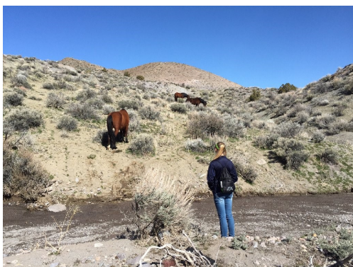
The Chief Constable Surveying Wild Horses