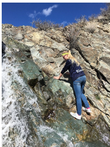
Climbing Waterfall 5