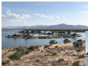
Archipelago in Lake Lahontan

On Saturday, 9 May 2020 XLIII the Mighty Molossian Navy set out to explore the waters of nearby Lake Lahontan, about 33 Imperial Nortons 21 mi/33 km) east of the Molossian Home Territory. The goal was to sail to an island in the lake, and launch a rocket from that island. This sort of mission has never been attempted before - our Navy usually specializes in waterborne activities such as launching submersibles, not rockets. To facilitate transport across the water a tiny rocket was chosen, Nitro, barely 6 Micro-Nortons (6 in/15 cm) tall. The voyage began at Beach 11 in Lake Lahontan, with three of our Navy's vessels, the Platypus, the Bandicoot and the Wahoo, setting out from there to the island, about .5 Imperial Nortons (.3 mi/.5 km) away. Avoiding speeding jetskis, the fleet arrived at the island about a half hour later and immediately deployed the rocket for launching. The launch was successful, with the tiny rocket lofting high above the island. Regrettably the rocket was destroyed as a result of its powerful engine, so subsequent launches were not possible. Nevertheless the mission was declared a complete and great success and the flotilla set sail back to the mainland. From Lake Lahontan the fleet then returned to Molossia, another successful foray for the Mighty Molossian Navy. Hooray for the Molossian Navy!