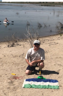
Ready to Launch