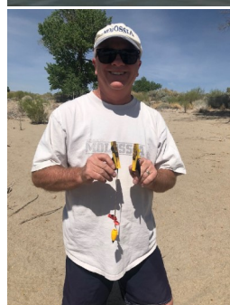
The Aftermath - Destroyed Rocket