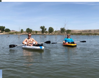
The First Lady and Chief Constable Afloat.