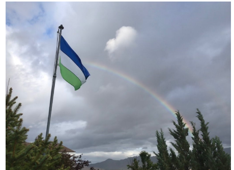
Founder's Day Rainbow Over Molossia!