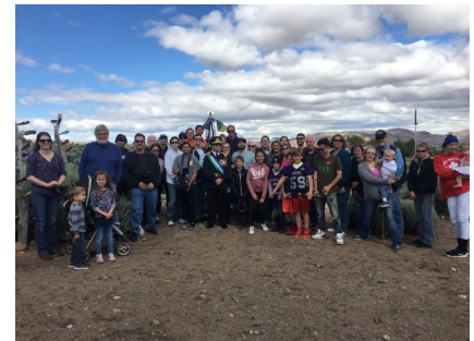
Everyone Who Helped Us Celebrate Founder' Day!