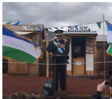
The President Delivering His Speech.