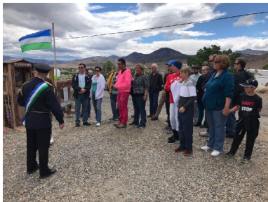
Founder's Day Tour

On Saturday, 26 May 2017 XLI, The Republic of Molossia turned 41 years old, another major milestone for our great nation. On a windy, sunny Saturday afternoon, friends, family and fans of our nation and proud Molossians gathered to mark our nation's birthday. The event began at 3:39 PM MST with a tour of Molossia given by His Excellency, The President and The First Lady. In all, over 40 people visited Molossia, here to help us celebrate our nation's birthday. Many of our visitors had never before been to Molossia, so the visit was a new experience for them. After the tour, our nation's guests gathered in Red Square for His Excellency's annual Founder's Day speech. Following the speech was a barbecue and general amicable gathering in Red Square, to wrap up the celebration. This concluded the official celebration of Molossia's 41st Founder's Day and a fine time was had by all!