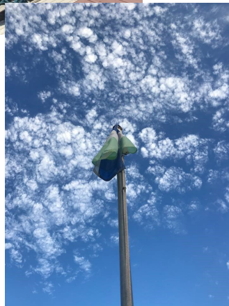
Clouds Over Molossia!