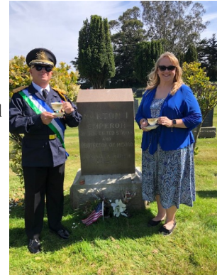
Tea With The Emperor

On Sunday, 9 June 2019 XLII His Excellency, The President and the First Lady visited Emperor Norton at his place of repose in Colma, just south of San Francisco. The late Emperor is an icon in the Republic of Molossia. Declaring himself to be the absolute ruler of the United States, a claim unrecognized by that nation, Emperor Norton was the first micronationalist, of a sort. This audacious claim, coupled with his contemporary notoriety, has established the Emperor as a pioneer among micronationalists and as such he is honored as a hero here in Molossia. Throughout our nation one can find a myriad of things and places named for Emperor Norton, including Norton Park, an element of our measurement system, and a cannon; the Emperor as well appears on Molossian stamps and money. And so, on a breezy Sunday afternoon, The President and First Lady took tea in the presence of the Emperor, a great honor from a great man - Norton I, The Emperor of the United States and Protector of Mexico.