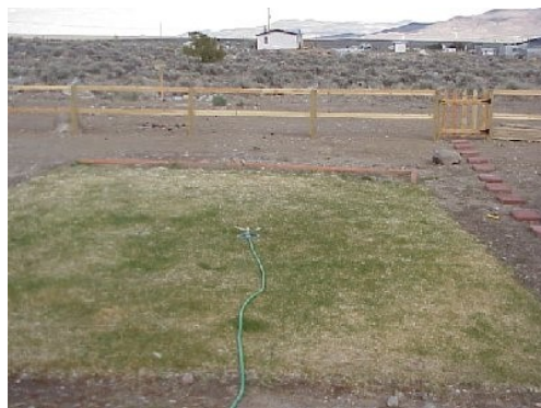
Molossia's Norton Park in 1999 and Today