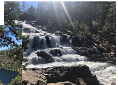
The President and First Lady exploring two beautiful waterfalls at nearby Lake Tahoe.