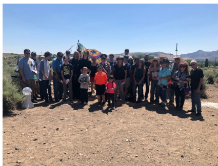
Great Tourist Group