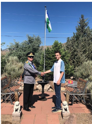
Two Presidents In Republic Square