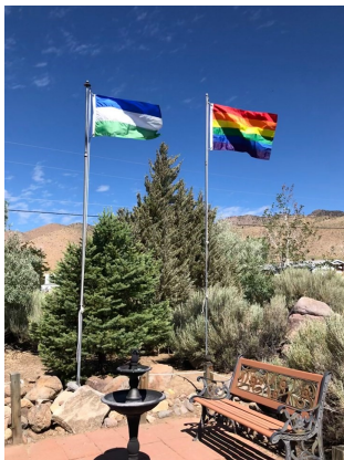
Celebrating Pride Day, 30 June in Molossia!