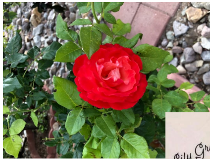
Another beautiful Molossian rose!!