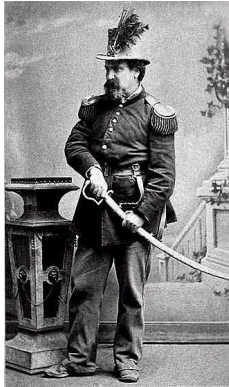
Emperor Norton In His Heyday

On Sunday, 9 June 2019 XLII His Excellency, The President and the First Lady visited Emperor Norton at his place of repose in Colma, just south of San Francisco. The late Emperor is an icon in the Republic of Molossia. Declaring himself to be the absolute ruler of the United States, a claim unrecognized by that nation, Emperor Norton was the first micronationalist, of a sort. This audacious claim, coupled with his contemporary notoriety, has established the Emperor as a pioneer among micronationalists and as such he is honored as a hero here in Molossia. Throughout our nation one can find a myriad of things and places named for Emperor Norton, including Norton Park, an element of our measurement system, and a cannon; the Emperor as well appears on Molossian stamps and money. And so, on a breezy Sunday afternoon, The President and First Lady took tea in the presence of the Emperor, a great honor from a great man - Norton I, The Emperor of the United States and Protector of Mexico.