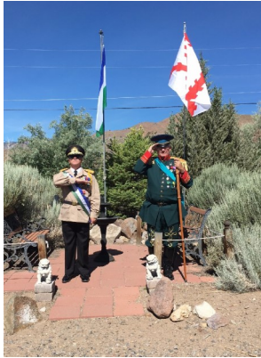
The President and the King in Republic Square