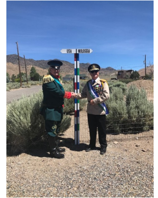
The President and the King at the Border