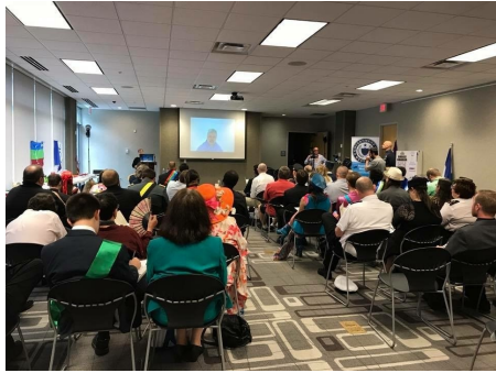
Conference in Session