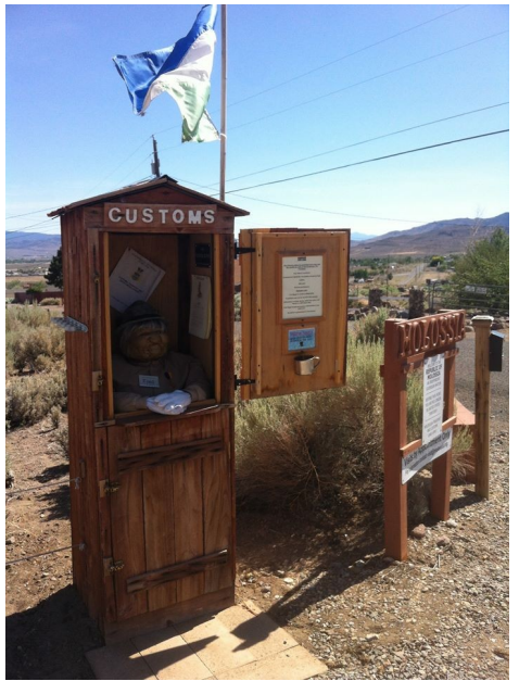
Molossia's Customs Shack in its new location