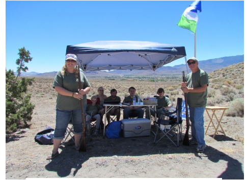
Weapons Practice Camp

On Sunday, 29 June 2014 XXXVII the Molossian Naval Infantry engaged in weapons training to improve their overall state of readiness. On a warm summer day the Naval Infantry set out for their rifle range in the foothills of the nearby Molossian Alps. Setting up on a dusty hillside, they began with archery practice, using the Chief Constable's compound bow. Following that the Naval Infantry practiced bayonet charges against practice dummies resembling East German soldiers. Next, the troops participated in weapons training and target practice. The weapons used were Pattern 1853 Enfield Rifle Muskets, the standard firearm of our Naval Infantry. The Enfield is a muzzle-loaded, black powder rifle, that fires a .58 caliber bullet; it can be complex to use for the uninitiated. Nevertheless our troops quickly gained proficiency in the weapon, hitting their targets accurately every time. After several hours, the Naval Infantry as a whole was considered to be accomplished in the use of their weapons and the training mission was declared a success. We are proud of our troops and are confident in their ability to defend our homeland with ease and skill.