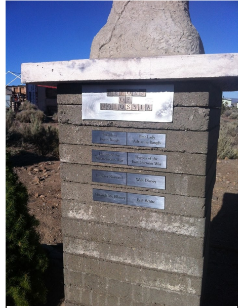
New Plaques on the Molossian Heroes Monument

See more photos here: http://unionfeatures.com/molossia-micro-nation