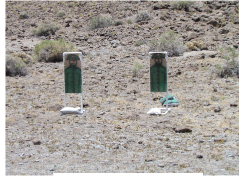
East German Targets