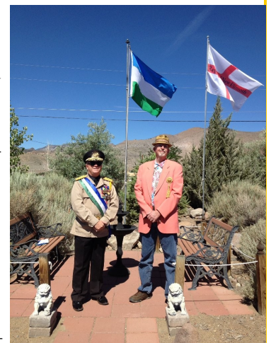
The President and The Governor General in Republic Square