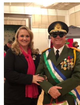
Festive First Couple