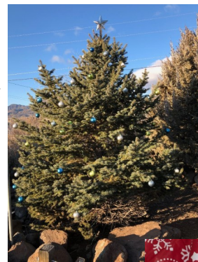
The National Christmas Tree In Republic Square.

Christmas is a major holiday in Molossia and a time of great tradition as well as festivity. Christmas is one of the most important holidays in the Republic of Molossia, and is traditionally a three-day celebration. The holiday actually begins on December 24th with Christmas Eve activities, including watching movies, baking (and eating) cookies, drinking eggnog and playing board games as a family - and the tradition of decorating Molossia's Christmas Crane. Christmas Eve dinner consisted this year of our traditional meal of lasagna, reflecting the Italian heritage of Molossia. The evening ends with the reading of the "Night Before Christmas", and with tracking the arrival of Santa Claus using NORAD's website. Christmas morning, December 25th, begins early, as the family descends upon the hoard of presents beneath the National Christmas Tree.