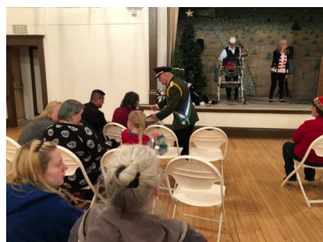
Passing Out Candy Canes

The Christmas Season is upon us, and in what has become an annual tradition, His Excellency, The President and The First Lady visited the annual Dayton Small Town Christmas, a tree-lighting and holiday event held in nearby downtown Dayton. This year the event was held indoors, in the Dayton Community Center, as opposed to the town park, due to inclement weather. The President passed out candy canes to children and visited Santa with the First Lady, while mingling with the festive holiday crowd. In addition, the First Couple were asked to judge a 4-H fashion show, which was truly enjoyable. As always, Molossians are very popular in the community outside our door, and it's a pleasure celebrate and share the Christmas holiday with them. Of course the event is an excellent opportunity to spread awareness of our nation as well as being great fun!