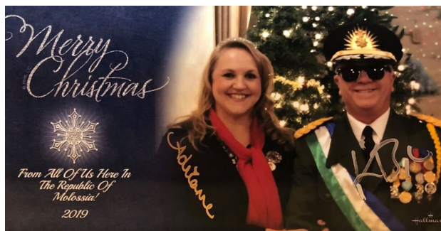
The 2019 Presidential Christmas Card.