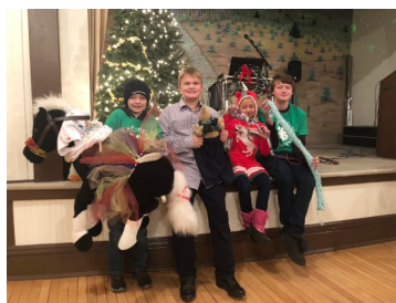
Proud v4H Kids