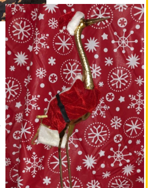
Molossia's Traditional Christmas Crane

The National Christmas Tree In Government House.