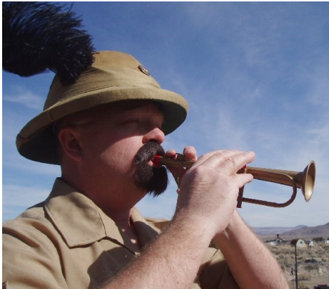
A dashing member of the Molossian Naval Infantry plays the Molossaphone.

The move to adopt the Molossaphone as our National Musical Instrument began in late 2007 XXX, when His Excellency, The President noted that our old National Musical Instrument, wind chimes, could not actually be played and had at any rate blown away in the direction of Utah. A replacement was in order, and the "kazoo", renamed the "Molossaphone", was selected. Now that we have a playable National Musical Instrument, one can expect to see the Molossaphone humming forth at every national event, and any other opportunity!