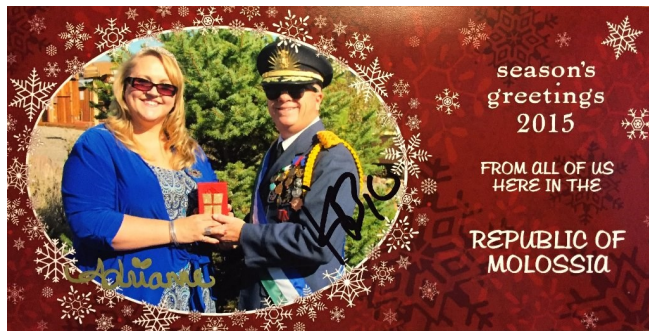
This Year's Christmas Card From The President and First Lady