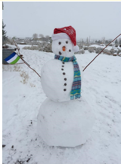
Molossia Snowman Created In The Aftermath Of The Christmas Eve Storm