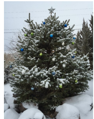
The National Christmas Tree

Christmas is a major holiday in Molossia and a time of great tradition as well as festivity. Christmas is one of the most important holidays in the Republic of Molossia, and is traditionally a three-day celebration. The holiday actually begins on December 24th with Christmas Eve activities, including watching movies, baking (and eating) cookies, drinking eggnog and playing board games as a family. Christmas Eve dinner is our traditional meal of lasagna, reflecting the Italian heritage of Molossia. The evening ends with the reading of the "Night Before Christmas", and with tracking the arrival of Santa Claus using NORAD's website. Christmas morning, December 25th, begins early, as the family descends upon the hoard of presents beneath the National Christmas Tree. Once the frenzy of present-opening ends, Christmas breakfast is made and served, and afterward everyone settles down to enjoy their gifts. Christmas dinner takes place in later afternoon, largely wrapping up a lazy, relaxing day. Christmas dinner consisted this year of turkey, ham, mashed potatoes, stuffing, and all the trimmings. Boxing Day is on December 26th, and is the last day of the Christmas holidays. While no special events take place, dinner on Boxing Day is traditionally Shepherd's Pie, in keeping with the British theme of the day. This wraps up the Christmas events for the year, with everyone eagerly looking forward to the distant arrival of next year's Christmas.