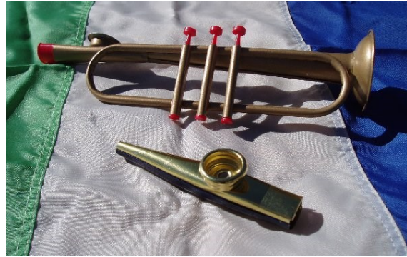
Types of Molossaphones