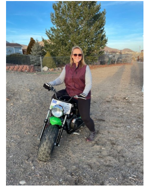
The First Lady Astride Her Minibike.

The Republic of Molossia is pleased to announce the advent of its first "sovereign" motor vehicles. Of course there are many cars and even a truck among the conveyances that call our country home. But, because of our small size and proximity to the US, those vehicles must be registered in the US. Recently, however, two minibikes were added to the transport fleet in Molossia and these are registered in Molossia alone. This makes them the first vehicles sovereign to our nation, and not under the authority of the United States. In spite of being registered solely in Molossia, these minibikes can still nevertheless voyage across the border into the US, local to Molossia, much as cars from the US can travel to Canada. The minibikes will be used to roam around our nation, and into the wilds over the border, as desired. We are quite excited and proud to have our own sovereign motor vehicles here in Molossia now, and look forward to them serving our nation well for many years to come!