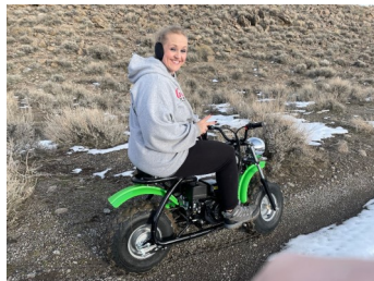
The First Lady Riding.