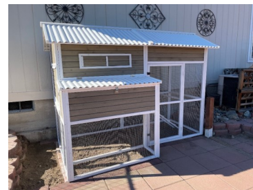
New Chicken Coop.