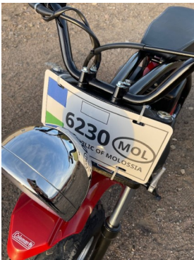
Molossian License Plate.