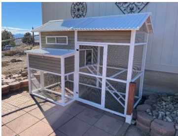
New Chicken Coop.

The Republic of Molossia is proud to be entering a new agricultural age. In an effort to attain more self-sufficiency, our government is launching a concerted effort to produce our own food. Past efforts in this direction have produced very limited results, but this new emphasis will inject fresh energy into the project. The first steps will be to raise chickens for eggs, and to this end a brand new chicken coop has been built directly behind Government House. The next step will be the creation of a large garden, with a wide variety of vegetables grown for our nation's consumption. Future plans include beekeeping, a distillery and possibly the introduction of goats. While our nation, lacking as it does area and natural resources, will likely never be food self-sufficient, these steps are extension of our ongoing Functionality and Sustainability Project, ensuring that our infrastructure works and sustains our nation. This farming initiative will certainly reduce our dependency on US markets for food as well as enhancing our independence and national pride, and makes our great nation even greater!