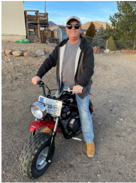
The President Astride His Minibike.

The Republic of Molossia is pleased to announce the advent of its first "sovereign" motor vehicles. Of course there are many cars and even a truck among the conveyances that call our country home. But, because of our small size and proximity to the US, those vehicles must be registered in the US. Recently, however, two minibikes were added to the transport fleet in Molossia and these are registered in Molossia alone. This makes them the first vehicles sovereign to our nation, and not under the authority of the United States. In spite of being registered solely in Molossia, these minibikes can still nevertheless voyage across the border into the US, local to Molossia, much as cars from the US can travel to Canada. The minibikes will be used to roam around our nation, and into the wilds over the border, as desired. We are quite excited and proud to have our own sovereign motor vehicles here in Molossia now, and look forward to them serving our nation well for many years to come!