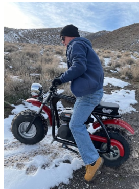
The President Negotiating Snow.