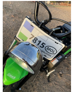
Molossian License Plate