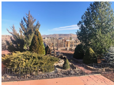
Trimming Trees Down

Norton Park is the garden spot of Molossia, an oasis of green in our sere desert land. It is home to the Molossia Railroad and hosts verdant grapes, colorful roses and towering pine trees. However, lately two trees became a nuisance of sorts and unfortunately had to be removed. The two junipers - originally thought to be a small variety when planted - instead grew to mammoth size, dominating the Molossia Railroad, blocking paths and threatening the national sanitation system. Thus it was determined that the junipers had to go. Over a period of two weekends, interrupted by foul winter weather, first one, then the second tree were toppled. The process was laborious, involving chopping, digging and even winching the trees from the ground. Finally, after much travail, the junipers fell and are now no more. In their place will instead be planted two Dwarf Alberta Spruce trees, a kind of miniature pine that will be more manageable in the small confines of the Park. Norton Park will bloom again in spring and no longer will the massive junipers spoil the tranquil beauty of the garden spot of Molossia.