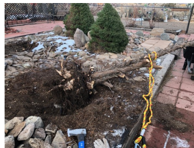
Second Tree Down