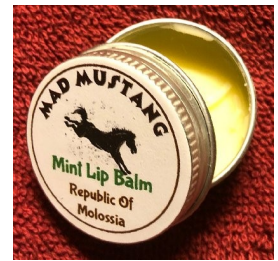
Peppermint Lip Balm

The Government of the Republic of Molossia is proud to introduce our latest export product, Mad Mustang Lip Balm. Made with the finest ingredients, and coming in two flavors, Lemon and Peppermint, Mad Mustang Lip Balm is ideal for invigorating your tired, chapped lips. Here in Molossia our dry desert climate saps the moisture from everything and none more than lips. Our scientists have labored long and hard to develop a special formula that will withstand our harsh desert sun and keep your lips soft and healthy. So don't wait, buy Mad Mustang Lip Balm today and get the most beautiful lips in the country!