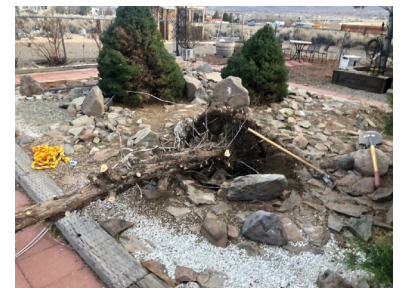
First Tree Down