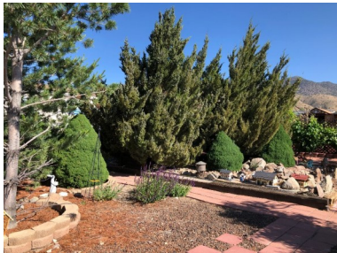
The Offending Junipers

Norton Park is the garden spot of Molossia, an oasis of green in our sere desert land. It is home to the Molossia Railroad and hosts verdant grapes, colorful roses and towering pine trees. However, lately two trees became a nuisance of sorts and unfortunately had to be removed. The two junipers - originally thought to be a small variety when planted - instead grew to mammoth size, dominating the Molossia Railroad, blocking paths and threatening the national sanitation system. Thus it was determined that the junipers had to go. Over a period of two weekends, interrupted by foul winter weather, first one, then the second tree were toppled. The process was laborious, involving chopping, digging and even winching the trees from the ground. Finally, after much travail, the junipers fell and are now no more. In their place will instead be planted two Dwarf Alberta Spruce trees, a kind of miniature pine that will be more manageable in the small confines of the Park. Norton Park will bloom again in spring and no longer will the massive junipers spoil the tranquil beauty of the garden spot of Molossia.