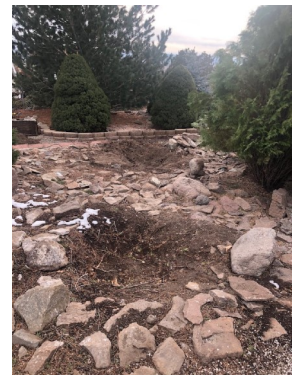
Trees Gone, Ready for New Trees