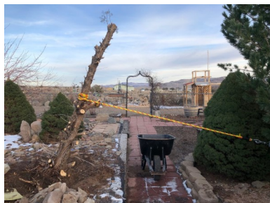
Winching the Second Tree