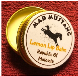
Lemon Lip Balm

The Government of the Republic of Molossia is proud to introduce our latest export product, Mad Mustang Lip Balm. Made with the finest ingredients, and coming in two flavors, Lemon and Peppermint, Mad Mustang Lip Balm is ideal for invigorating your tired, chapped lips. Here in Molossia our dry desert climate saps the moisture from everything and none more than lips. Our scientists have labored long and hard to develop a special formula that will withstand our harsh desert sun and keep your lips soft and healthy. So don't wait, buy Mad Mustang Lip Balm today and get the most beautiful lips in the country!