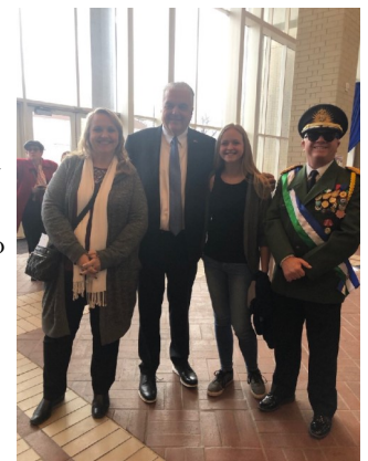
Meeting the New Governor