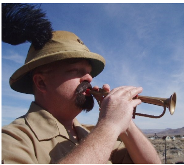
A dashing member of the Molossian Naval Infantry plays the Molossaphone.

The move to adopt the Molossaphone as our National Musical Instrument began in late 2007 XXX, when His Excellency, The President noted that our old National Musical Instrument, wind chimes, could not actually be played and had at any rate blown away in the direction of Utah. A replacement was in order, and the "kazoo", renamed the "Molossaphone", was selected. Now that we have a playable National Musical Instrument, one can expect to see the Molossaphone humming forth at every national event, and any other opportunity!