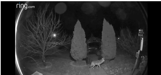
A Coyote Visits Molossia, Passing in Front of Government House!