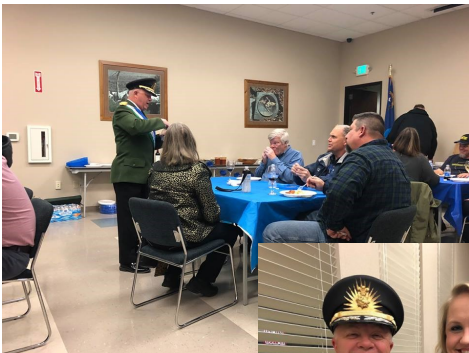
The President and First Lady Meeting with the Local Dayton Chamber of Commerce as Part of Our Outreach Program