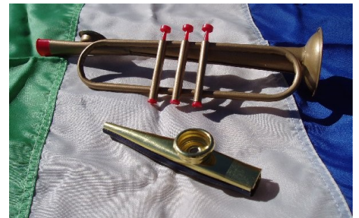
Types of Molossaphones.