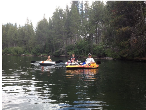
The Navy exploring Donner Lake.