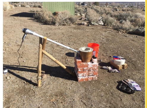
Foundry At The Ready