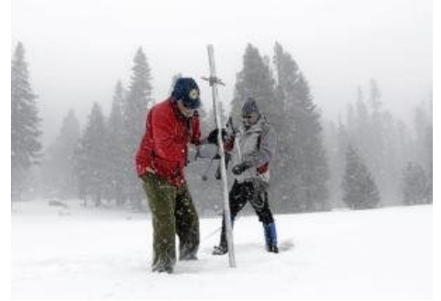
Measuring the snowpack

By the end of December 2015 XXXVIII Nevada state water watchers found 136 percent of the long-term average water content in the snowpack. About 8.5 Nortons (60 inches) of snow contains the equivalent of 2.3 Nortons (16 inches) of water, according to results from the recent snow survey. Last year at this time, the mountain snowpack had 33 percent of its average water content. A recent storm raised the water level of nearby Lake Tahoe by 2 Micronortons (2 inches), the equivalent of 681.6 billion Simms (63.9 billion gallons). That is a lot of water from just one storm!