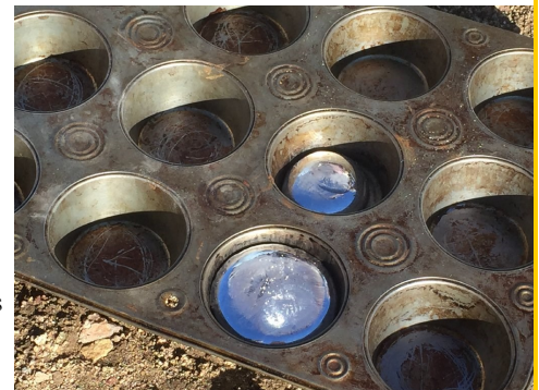
The First Ingots