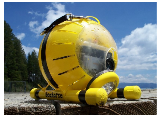
The Seahorse diving bell is designed to go deep beneath the waves and explore, going where man cannot, or won't, to avoid getting wet.

Of course our nation, like any, requires the ability to defend itself. To that end, we have finally formed a viable military service. In conjunction with the Navy, we now have the Molossian Naval Infantry. Though small, our Naval Infantry is well armed, with two state-of-the-art 1853 Enfield rifle-muskets, complete with bayonets. Our Naval Infantry's training is impressive, and our loyal and brave infantrymen always stand ready to defend Molossia against all enemies, foreign and domestic.