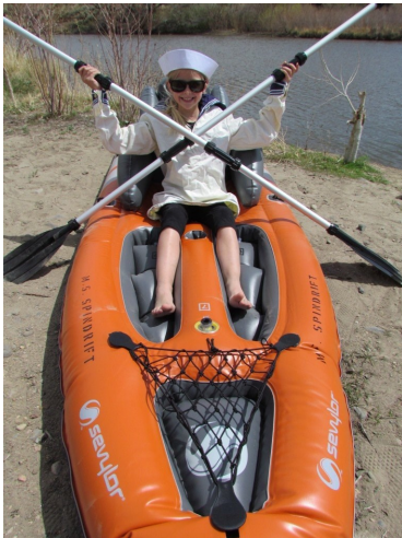
A stalwart sailor aboard the M.S. Spindrift.

Our goal with the Molossian Navy is to explore those watery places that dot the western landscape like gems in the sand. There are actually quite a few lakes and reservoirs through the western desert, and we have set our sights to explore as many as possible. In addition, our Navy stands ready to defend Molossia whenever necessary, through the means of our valiant Naval Infantry.