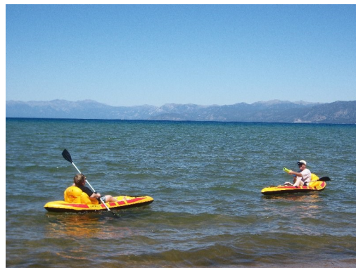
Mock Naval battle on Lake Tahoe.