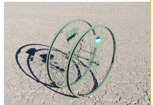
The Great Panjandrum