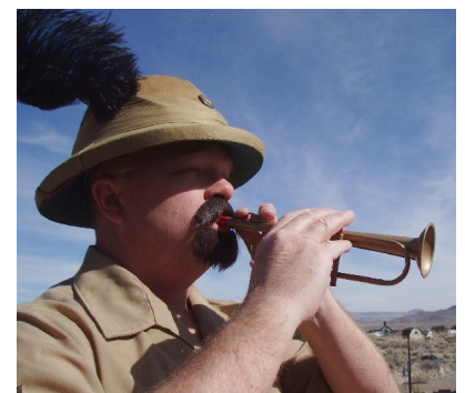
A dashing member of the Molossian Naval Infantry plays the Molossaphone.