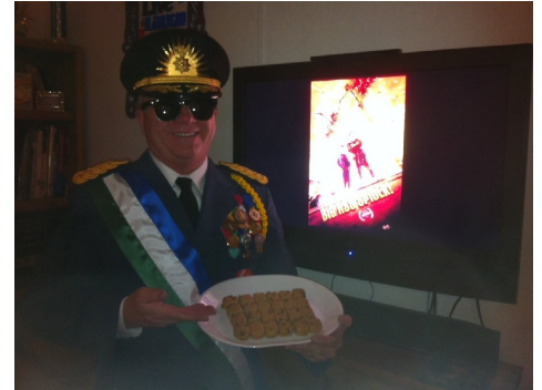
Cookie Dough Ready!

The Cookie Dough Fest is a staple of Molossian culture. In fact cookie dough itself is so important to our nation that it forms the basis for our currency, the Valora. Dating from our brief affiliation with the United Provinces of Utopia in 1999 XXII, the Cookie Dough Fest involves simply watching monster movies of questionable quality while eating raw cookie dough. In the past a perennial favourite was the "Tremors" series of movies, although just about any B movie will do. Lately, the eating of raw cookie dough has been curtailed a bit due to salmonella concerns and has been somewhat replaced by cookie dough ice cream, but the tradition remains largely the same. On 11 January 2014 XXXVII Molossians held their first Cookie Dough Fest of the New Year, a belated celebration of Emperor Norton Day, which falls on 8 January. The movie of the evening was "Big Ass Spider" about, appropriately, a giant spider rampaging through Los Angeles. Intentionally tongue in cheek and hilarious, it was the perfect choice for the evening, and for the occasion cookie dough was mixed with cookie dough ice cream. A fine time was had by all and we look forward to many more Cookie Dough Fests in the future!