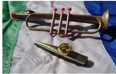
Types of Molossaphones.