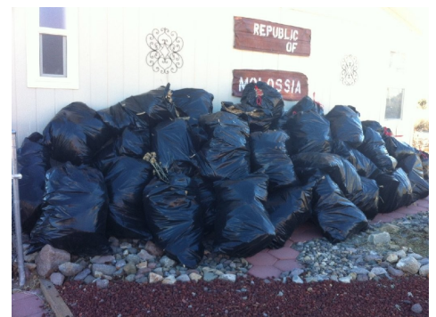
Tons of weeds ready for export to the US.