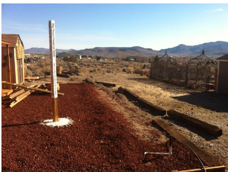
Red Square ready for a remodel.

The holidays are over and the time has come to begin our latest building project, expanding and remodeling Red Square. Red Square lies to the north of Government House and is home to the Molossia Post Office, Bank of Molossia, Office of the President, Molossia's Tiki Hut Bar and Grill, and more. The expansion will make room for the long-planned Molossia Constabulary and for a picnic area and badminton grounds. The first stage of the project involved removing dozens of rabbit brush bushes and sagebrush. Next will come installing more privacy fencing along our northern frontier with the US, followed by expanding the Red Square retaining wall east, toward the Back Forty. After that is done, the area will be backfilled with dirt and more red gravel, streetlights and picnic benches will be installed and the expansion will be done. Sometime in late spring, the Constabulary will be built, as well as an outdoor kitchen for the Tiki Hut. By then it will be tourist season and time to show our new square off to the world!