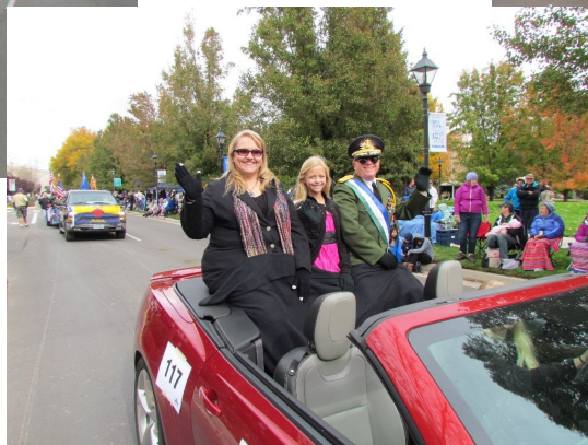
Smiling And Waving