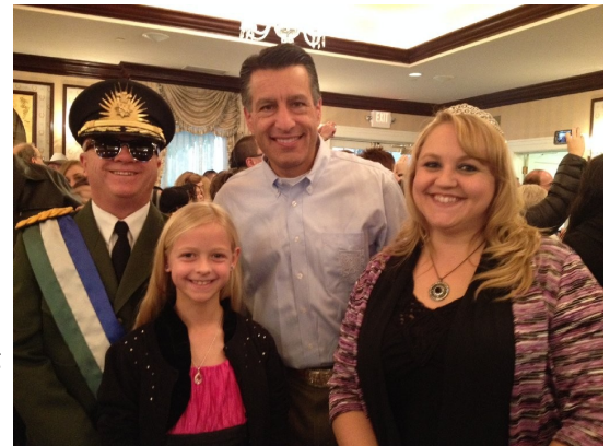
The President, First Lady and First Daughter with Nevada Governor Brian Sandoval.