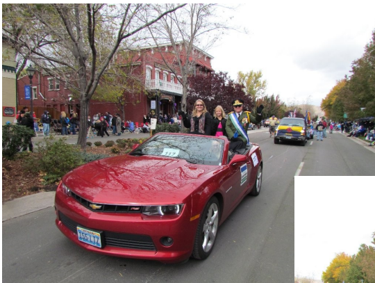
On The Parade Route.