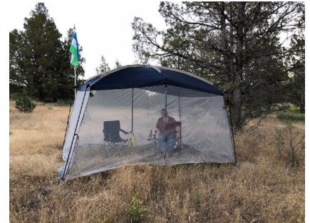
Farfalla Evening By The Flag