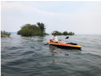
The President Afloat

On Sunday, 22 July 2018 XLI the Molossian Navy deployed to nearby Lake Tahoe, a favored spot for the Navy's many voyages of discovery. The target this time was at the north end of the lake near Tahoe City, a secluded beach area called Lake Forest. The Navy has never explored this area of Lake Tahoe before, so this voyage was to cover new ground - or water, rather. Arriving at about 11:00 AM MST, the Navy deployed immediately onto the lake, and quickly set as its destination a copse of semi-submerged willows not far off shore. Upon arriving at the bushy atoll it was discovered that the brush and trees hid a tiny island, a marshy islet reminiscent of a mangrove swamp in the American south. The President and Chief Constable went ashore to explore the mysterious islet, a brief foray considering the small size of the island. The duo then returned to the rest of the fleet and completed a circumnavigation of the islet before voyaging further afield in the vicinity. After navigating adjacent waters and practicing deeper water boarding, the Navy eventually returned to shore, mission complete. The fleet then returned to Molossia, another successful mission for the Mighty Molossian Navy!