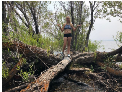
The Chief Constable Exploring