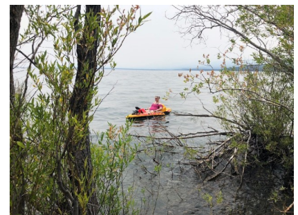
The First Lady Circumnavigating