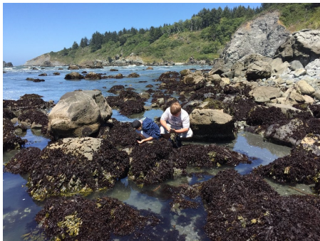
Patrick's Point Beach

the exact spot on the Pacific Coast that lies on the same latitude as Molossia. At latitude 39° 19' 8.40" N, Jack Peters Gulch just north of Mendocino, our valiant sailors unfurled our flag and with that wrapped up an amazing voyage of discovery to the Pacific Ocean.