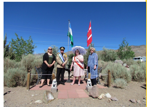
The President, First Lady, the Queen and Duchess in Republic Square