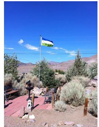
A beautiful day in Molossia!