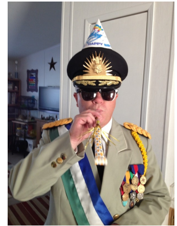
Happy Birthday, Mr. President!