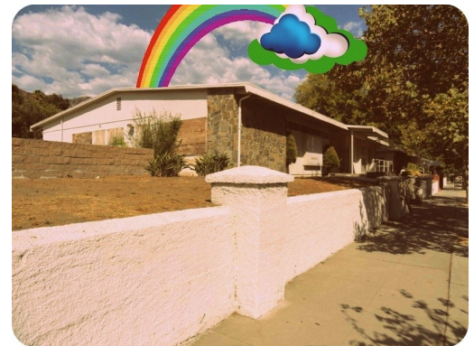
The President's Birthplace