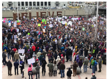
A Crowd For Change