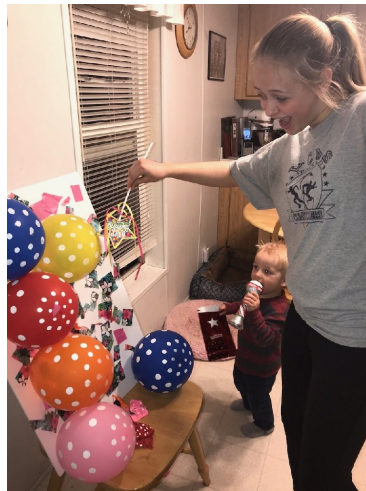
The Chief Constable Shows How It's Done