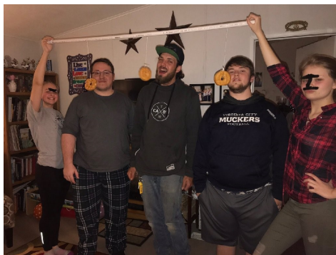
Guys vs. Donuts