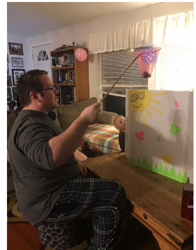
Fishing For Prizes