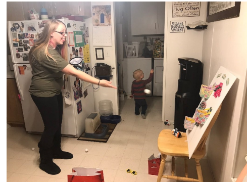
Tossing The Ball