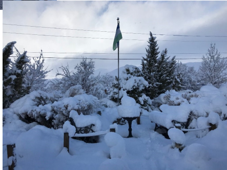
Republic Square, Third Snowfall