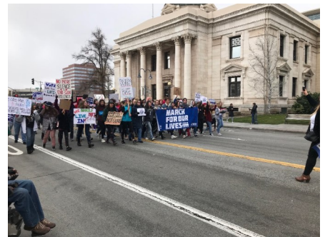
On the March

On 24 March 2018 XLI The President, First Lady and Chief Constable attended the March For Our Lives, a movement to protest gun violence and assault weapons. Held in Reno, Nevada, about 35 Imperial Nortons (35km) northwest of Molossia, the protest included over 1,000 marchers, including our own President, First Lady and Chief Constable. The Chief Constable in particular holds this cause dear, feeling strongly about the many senseless deaths in school shootings. She spearheaded a school walkout from her school in near-by Virginia City on 14 March, in memory of the students slain in the 14 February school shooting in Parkland, Florida. Said the Chief Constable, "I'm happy to see people come together to make a difference, but it's sad that it has to be for this reason." It is hoped that the March For Our Lives movement will indeed bring change and make a real difference in combating gun violence.