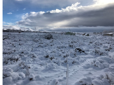
Snowy Molossian Desert, Third Storm