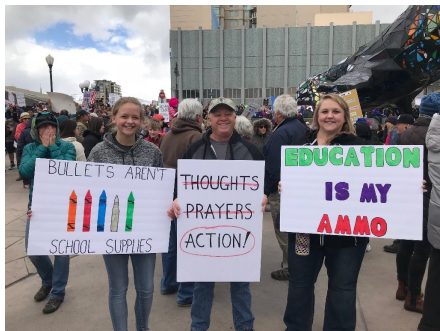
Signs and Holders