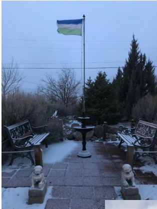
Republic Square, First Snowfall

March winter showed up for real, late and ready for action. The first real snowstorm of the year arrived on 3 March, dumping at least a Norton of snow on our nation. Thereafter followed a respite and two weeks later the next storm blew in, this time dumping almost two Norton's of snow on our fair land. Of course, being a desert nation, we welcome the water that snow brings, but in it's right place and time! March isn't that time, it's the time to be looking forward to spring! Well, there's not much we can do about the weather, in spite of Mark Twain's advice, so we just need to dig out, stay warm and know that sunny days are right around the corner here in Molossia!